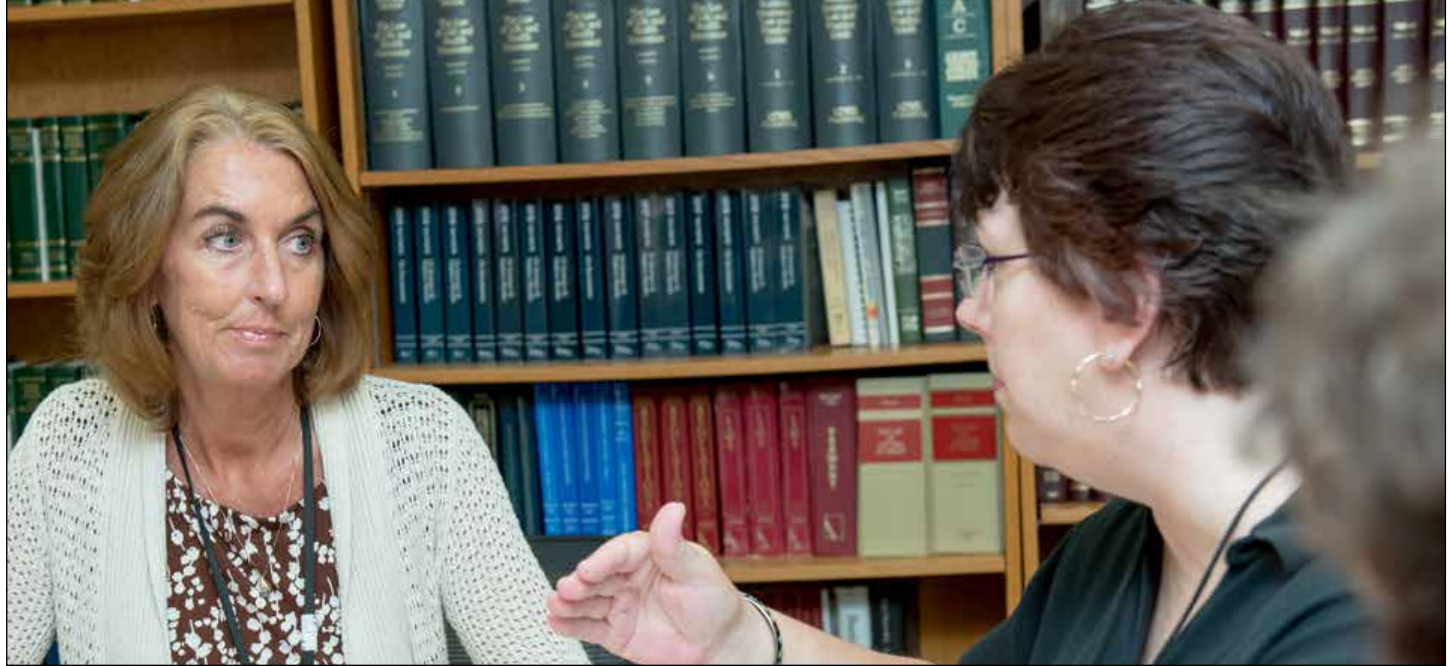
Page 8 - State of Vermont Onboarding Guide

There is a wealth of information on interviewing in the interviewing section of our website. Your Talent Acquisition Specialist is also available for consultation. Finally, the Talent Acquisition team offers regular Interviewing and Hiring classes as well as customized on-site classes for Departments.