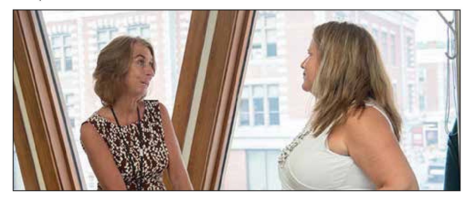
Page 20 - State of Vermont Onboarding Guide

List any other job-related requirements that need to be completed in the next 6-12 months or beyond.